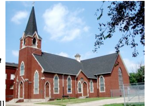
Bethlehem Lutheran Church

More than 2000 years ago, a baby was born in the small town of Bethlehem outside of the city of Jerusalem. It was a humble beginning. With no room left in the inn, He was born in a stable. He had no soft pillow on which to lay His head, only the straw of the feeding trough for the stable animals. His birth was announced by the angels of God to poor shepherds who were his only visitors. But this small baby, born to a carpenter and his young